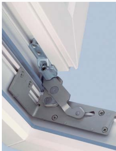
3D adjustment in the pivot rest for optimal lateral, vertical and gasket-compression adjustment of the window sash