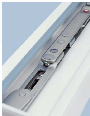
Easy rebate clearance adjustment by means of a screw and 4mm Allen key