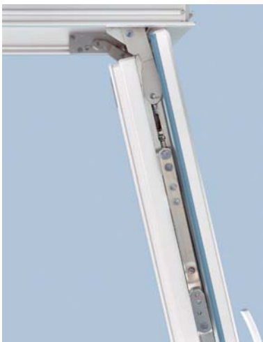
Wide opening Roto NT Designo can be opened up to 100°

Finest technology. All components are fully integrated in the window sash, making them invisible from the outside. Sashes can be adjusted in three planes via adjusting screws. Rebate clearance adjustment is carried out via the corner hinge and the stay guide. Low-maintenance: Special grease slots guarantee permanent lubrication of the hinge bars, reducing wear and tear.